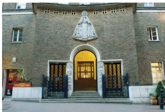
When you come to this country you feel so lost but here I met other Congolese people and this reminded me that I am not alone. The Refugee Council put me in touch with the church. The church is so special to me. It is a refuge.