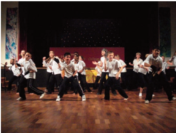
Students at Bishop David Brown School, Woking performing as part of Safe and Sound

However, we are not complacent and feel there is much more work to do. We have learnt a great deal, and know that what we do, we can do better. We are keen to extend awareness raising work to a wider range of schools across the South East, and wish to extend the length of residencies to fully establish the medium and longer term impacts, and to measure whether there is fundamental attitude change. We want to know what people do, say and think weeks, months and years after our work.