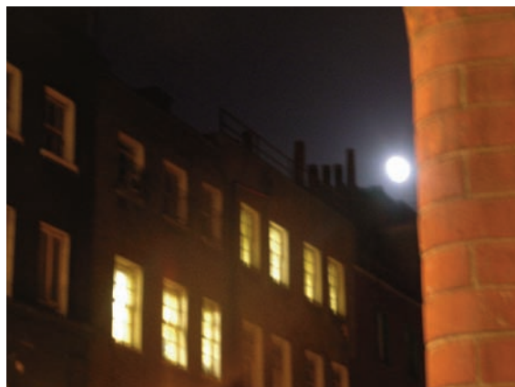
Full moon means togetherness for Chinese people. But for me, the only thing I can do is glimpse the moon at a dark corner.

The mentoring part of New Londoners is now finished, though many of the relationships continue more informally. We are working with an independent publisher to bring all the images