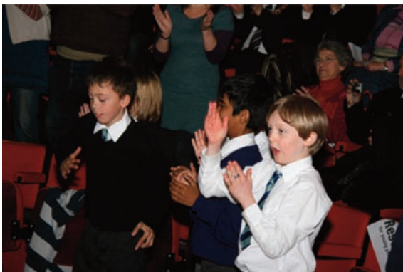
St Mary's CE primary students dancing at the Stay-a-While event.

We are very fortunate to have secured core funding for three years from the Baring Foundation Arts Core Fund, funding the development of this work, and we are very grateful for their support and investment in what we are doing.