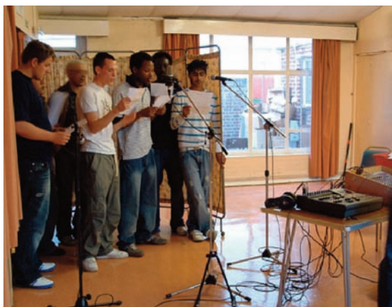
Cricket Roots recording session June 2007 involving asylum seeker and host community young people

integrate and join up the delivery so that the creative work supported and enhanced the key learning outcomes.