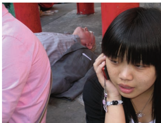
A 'foreigner' lying in China town? Well, in fact we are all 'foreigners'.